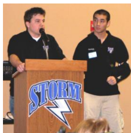
Skip & Simon give pros & cons of not making playoffs