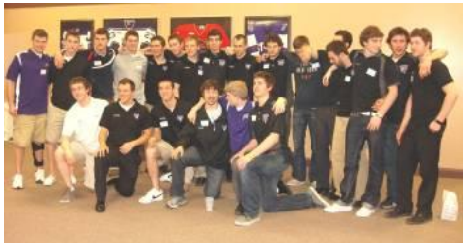
The Tri-City Storm – 4-10-2011