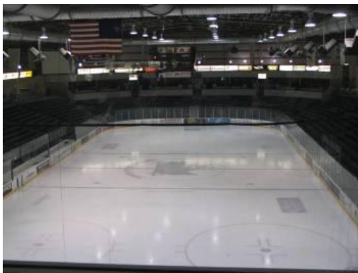
End of Season 11