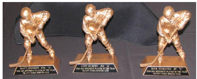
Storm fans voted for their favorite forward and defensive players during the March 25 th and 26 th home games. These trophies were awarded at the Appreciation Dinner.