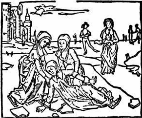
The World's Oldest Known Skating Image