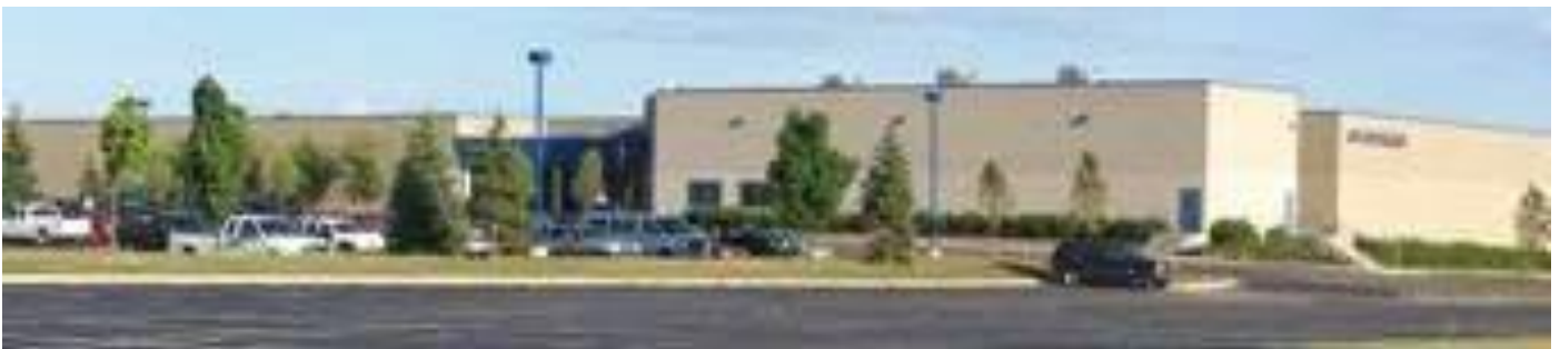
The Ice Cube at Ann Arbor, Michigan

(quote from vintagegmhockey.com/St.PaulVulcans )