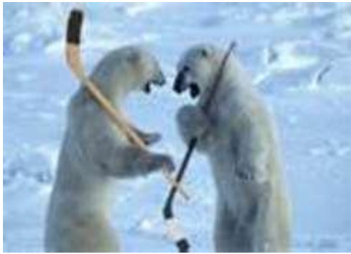
Global warming may endanger the future of polar hockey

Tri-City Storm Booster Club P O Box 2101 Kearney NE 68868