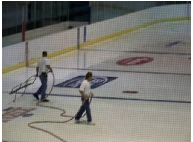
Spraying the Ice

Then came the tedious job of building up the ice over the markings. It was sprayed with a thin layer of water to freeze down the vinyl. Then more layers were sprayed on. Each was given about 15 minutes to freeze and then it was sprayed again. This went on for about 24 hour which meant some members of the maintenance crew pulled night duty.