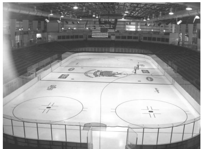
Finished! As viewed from the VIP room upstairs

The next step was to zamboni the ice. It was not shaved off, just more water was put down. Finally the job is done and we have ICE!