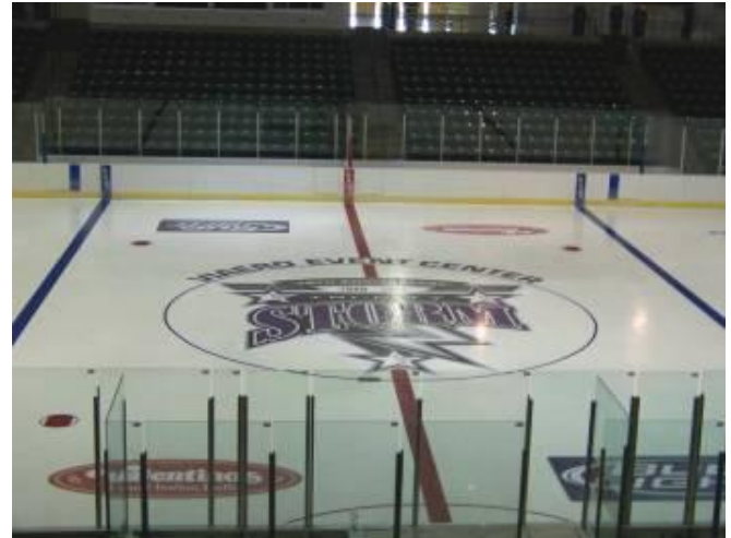
The Storm Logo at Center Ice

It’s not readable in the photo, but in that white area on the banner over the word “Storm” is “2000-2010” .