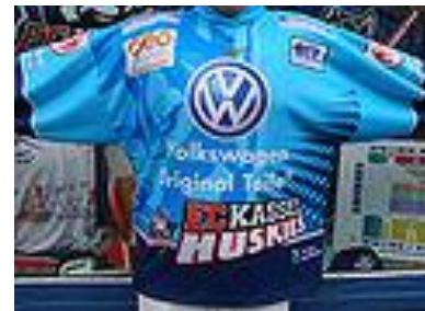
Kassel Huskies Jersey