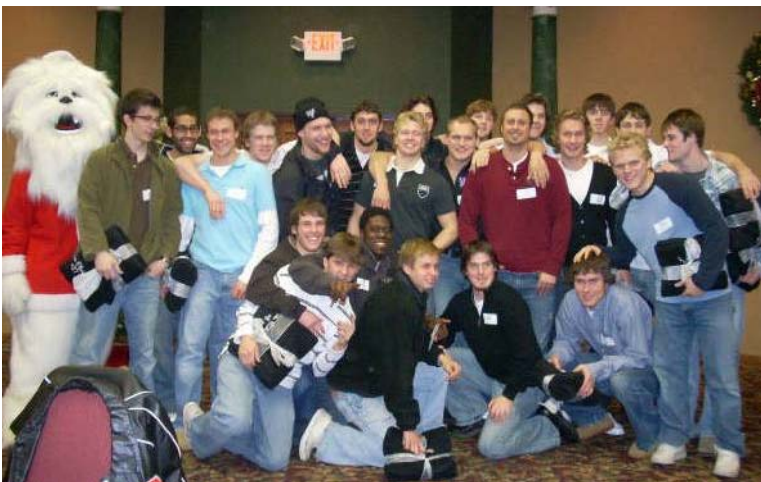
Stormy poses with the whole team

On the evening of December 2 Storm team members and Storm fans gathered at the Holiday Inn for a Holiday Party. [Details on page 2]