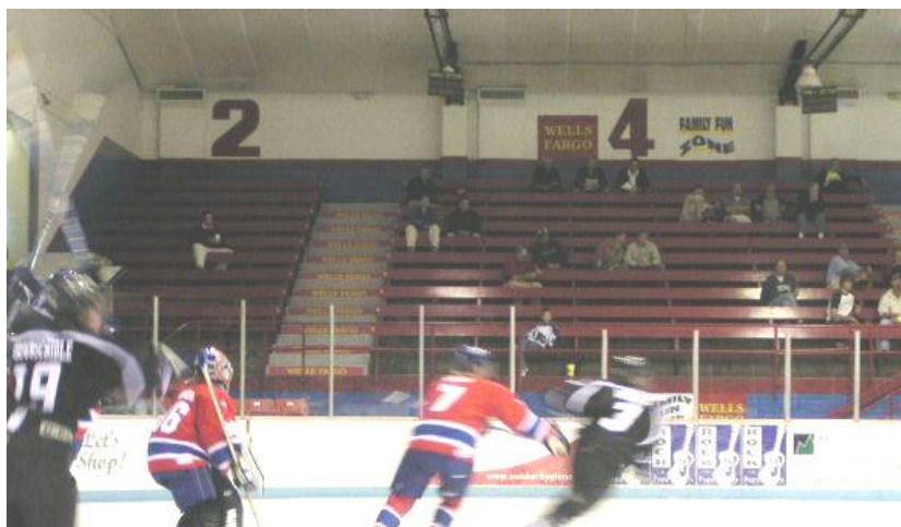
This interior view of the arena shows how close the ceiling is to the top of the bleachers.