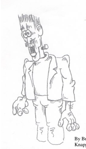
By Butch Knapp